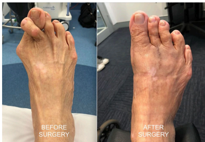
A DR ZILKO PATIENT PRE-OP & 3 MONTHS POST-OP

This is the 'gold standard' procedure for moderate to severe arthritis. The remaining cartilage in the joint is removed, the bones on either side of the joint are fused together and held with a plate and screws. 90-95% of patients will experience excellent pain relief with this. However, the joint is stiffened and this limits the wearing of high heels and makes running difficult. There is a small risk of developing arthritis in the next joint along the big toe but this is rarely troublesome.