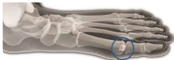
THE CARTIVA IMPLANT

Some patients with early-to-moderate wear and tear of the cartilage on the metatarsal head are amenable to a resurfacing procedure with the Cartiva implant. This is a small plastic (polyvinyl alcohol) implant which opens up the joint and offloads the degenerate areas. This procedure can provide good pain relief whilst maintaining some movement at the 1st MTP joint.